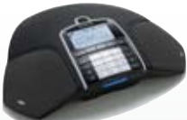
FOR DECT ENVIRONMENTS Konftel 300W

Connection: wireless DECT/GAP, mobile*, USB for VoIP. Number of participants: Up to 10. Unique features: Battery with 60h talk time, SD call recording, conference guide, line selector. DECT compatible with: Alcatel-Lucent, Aastra, Ascom, Avaya, Ericsson, Nortel, Panasonic, NEC-Philips, Siemens. Certified for: Avaya, Siemens. Interoperates via USB-connections to: Microsoft Lync, Skype and other communication tools.