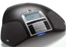
FOR ALL AUDIO CONFERENCES Konftel 300

Connection: Analogue, mobile*, USB for VoIP. Number of participants: Up to 10. Number of participants with expansion microphones: Up to 16. Number of participants with PA connection: More than 16. Unique features: SD call recording, conference guide, line selector, headset connectivity, PA connectivity. Certified for: Avaya. Interoperates with USB-connection to: Microsoft Lync, Skype and other communication tools.