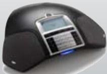
ANALOGUE Konftel 250

Connection: Analogue. Number of participants: Up to 10. Number of participants with expansion microphones: Up to 16. Unique features: SD call recording, conference guide.