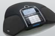
FOR MOBILE NETWORK Konftel 300M

Connection: Analogue. Number of participants: Up to 10. Number of participants with expansion microphones: Up to 16. Unique features: SD call recording, conference guide.