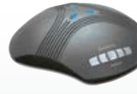
FLEXIBLE Konftel 60W

Connection: To digital & IP system phones, DECT*, mobile*, pc for VoIP. With or without cord. Number of participants: Up to 6. Number of participants with expansion microphones: Up to 10. Unique features: Bluetooth, flexible use. Certified for: Avaya, Alcatel-Lucent, Siemens.