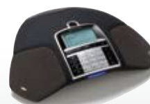
SIP Konftel 300IP

Connection: Analogue, mobile*, USB for VoIP. Number of participants: Up to 10. Number of participants with expansion microphones: Up to 16. Number of participants with PA connection: More than 16. Unique features: SD call recording, conference guide, line selector, headset connectivity, PA connectivity. Certified for: Avaya. Interoperates with USB-connection to: Microsoft Lync, Skype and other communication tools.